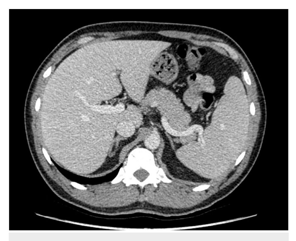
FIGURE 1: Computed tomography scan showing an enlarged liver and spleen

Vitamin B12 levels were normal, and DAT was strongly positive for warm antibodies (Figure 2). A diagnosis of warm-AIHA was established and treatment with prednisolone at 1 mg/kg/day was started.