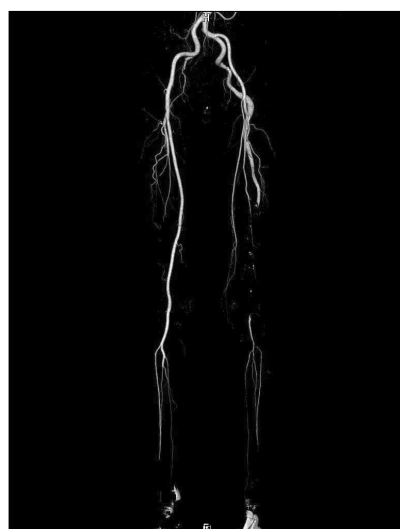
Fig. 3. Preoperative computed tomography (CT) angiogram (2nd operation). Similar findings compared to preoperative CT angiogram (1st operation) with no definite aggravation of arteriosclerosis and aneurismal change.

without any interval aggravation of arteriosclerosis or aneurysmal change (Fig. 3). Thromboembolctomy was performed