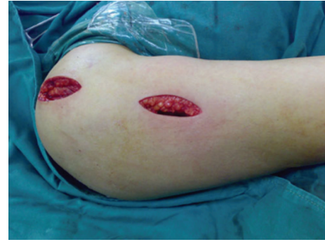
FIGURE 1: MIPPO with anterolateral delta-split approach in a patient with II-part greater tuberosity fracture: the skin incision at the anterolateral tip of the acromion.

Imaging with X-ray and CT was performed preoperatively to evaluate the fracture type. Patients were in a beach chair position under general anesthesia. A skin incision was made at the anterolateral tip of the acromion extending approximately 5 cm distally (Figure 1). Triangular muscle fibers were tagged with suture in the distal incision. The pectoral fascia was opened to expose the humeral head and the tuberosity of the humerus. The tendon on the surface of the greater tuberosity was tagged with nonabsorbable suture. The greater tuberosity was flipped to reveal the surface of humeral head. The fracture was then reduced and grafted if needed. The greater tuberosity and humeral head were pinned provisionally with one or two Kirschner wires. If the lesser tuberosity was injured, it was pinned as well. The reduction was confirmed with fluoroscopy. A 5-hole PHILOS-plate was used. A 3 cm incision was made longitudinally underneath the proximal incision to expose the anterolateral