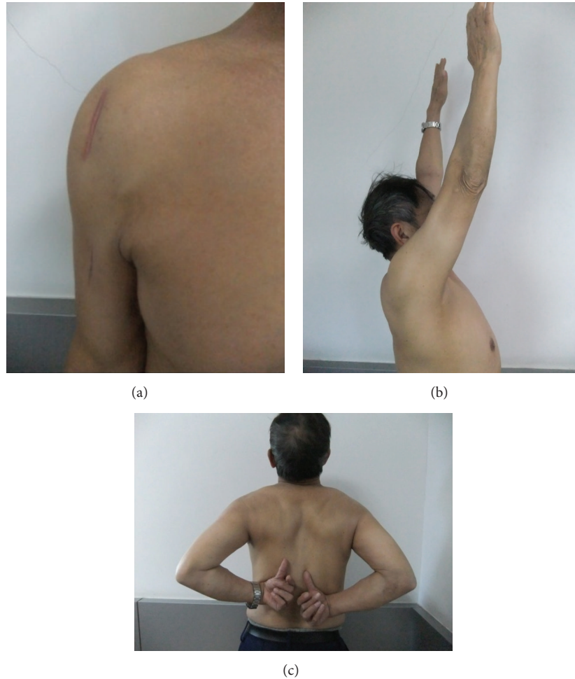
FIGURE 4: (a) The incision healed during the follow-up in a patient with II-part greater tuberosity fracture. ((b) and (c)) After removal of the implant, the patient has good function.

nerve damage, postoperative nerve or vessel damage, infections, DVT, or death was observed.