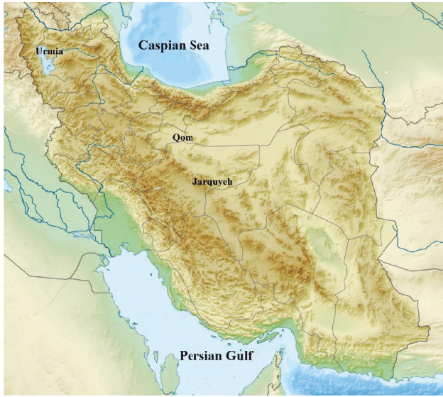
FIGURE 1: Three samples were collected from different regions of Iran.

activity of treated cells. The MTT assay is broadly known as a reliable method to study cell viability [14, 15]. The results were presented as percentages (control value = 100%). All tests were done three times. The percentages of cell viability were measured using the following equation: