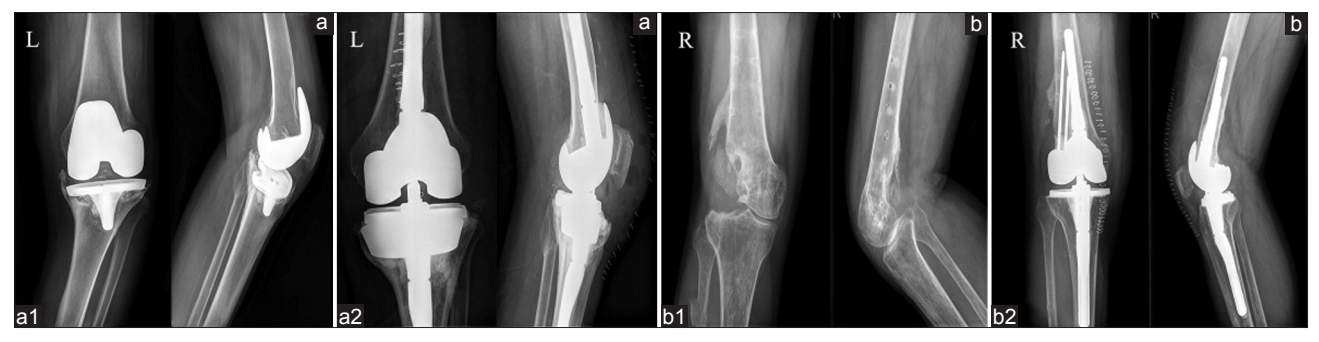
Figure 1: (a) A female aged 70 years underwent a revision TKA due to aseptic loosening: (a1) The preoperative radiographic view showed aseptic loosening of the tibial component; (a2) The postoperative view showed that a tibial augment implant was applied to manage the severe bone loss. (b) A male aged 78 years underwent a primary TKA due to severe posttraumatic bone loss: (b1) The preoperative radiographic view showed severe bone loss; (b2) The postoperative view showed that a second-generation CCK prosthesis was applied to manage the severe bone loss. TKA: Total knee arthroplasty; CCK: Constrained condylar knee.

TKA: Total knee arthroplasty; SD: Standard deviation; HSS: Hospital for Special Surgery.