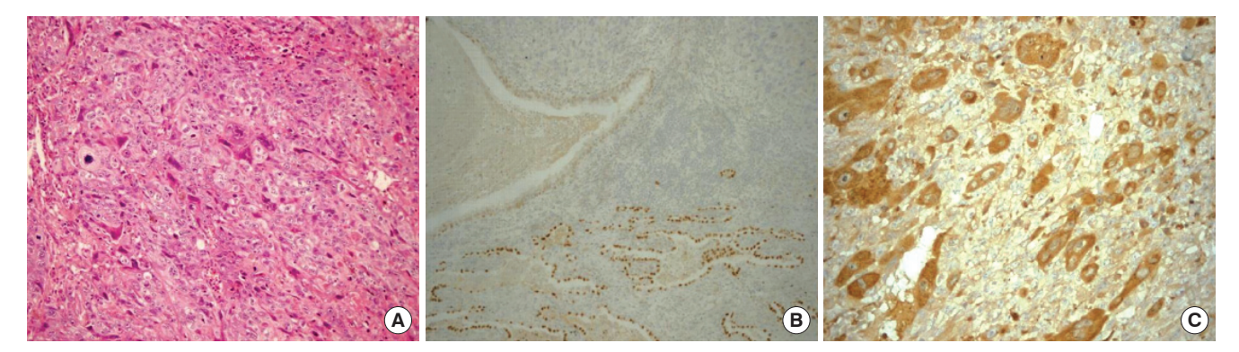
Fig. 2. Histopathological pictures of the tumor which represents of the pleomorphic carcinoma. (A) The tumor consists of polygonal tumor cells (H&E), (B) TTF-1 negativity of the tumor (upper part of the picture) while non-tumoral lung parenchyma showed TTF-1 positivity, (C) BhCG positivity in the giant multinuclear tumor cells.

1806 http://jkms.org D0I: 10.3346/jkms.2010.25.12.1805