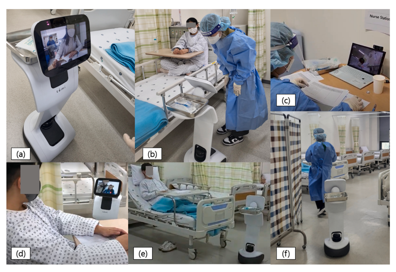
Fig. 3. Simulation setting and mobile robot: (a) Medical staff outside the isolation room displayed on the robot screen, (b) Communication between the isolation room and the outside through the robot, (c) Remote consultation from outside the isolation room, (d) Video calls between the patient and the outside of the isolation room, (e) Robot delivering medication along mapped paths, (f) Robot autonomously tracking medical staff without physical contact.