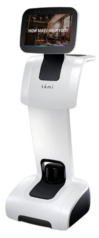
Fig. 1. Mobile robot used in the study.

12 patients. As a standard practice, one nurse was assigned to three rooms in a four-bed setup. According to a previous study, on average, the frequency of room visits was approximately 6 times per room, resulting in a total of 18 entries and exits for the three rooms [20]. The scenario in this study assumed that a nurse inside the isolation room would care for the patient while communicating with a nurse at the station.