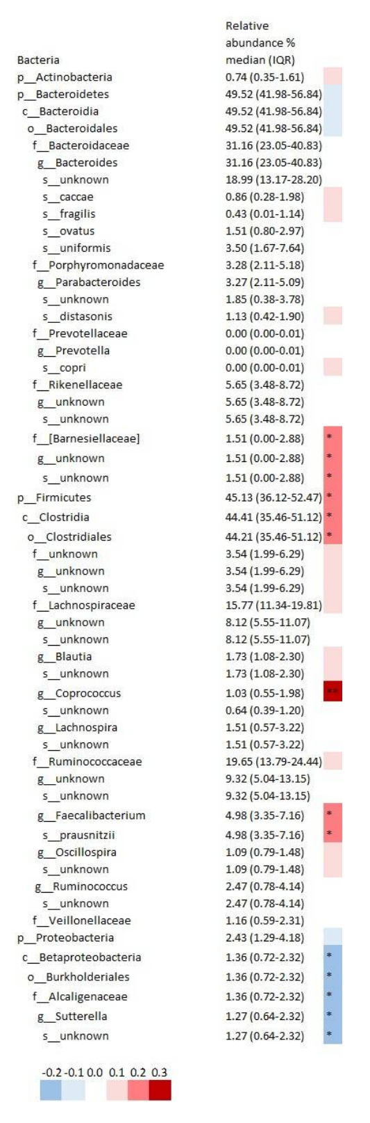
Figure 2. Correlations between IDQ scores and the relative abundance of bacteria. * FDR < 0.2, ** FDR < 0.1. The p -values for the correlation were corrected for multiple testing. The false discovery rate (FDR) was 0.2 *, but also those with FDR < 0.1 are shown **. The colors represent the Spearman's rho (blue: negative correlation, red: positive correlation).

poor dietary quality, however the differences no longer remained statistically significant when adjusted for multiple testing (adjusted p > 0.35) (Table S2).