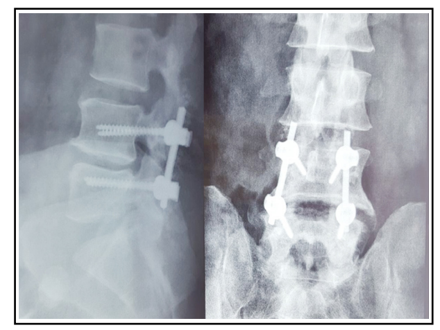
Fig.3: Plain X-ray thoracolumbar spine showing post-operative images of a L4-5 pedical screw fixation for dynamic listhesis.

The mean accuracy for placement of the screws in our patient group was 96.6%.Literature search reveals that over 8,000 screws have been placed in different studies with the mean accuracy for