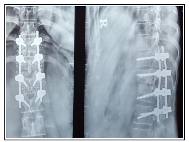
Fig.2: Plain X-ray thoracolumbar spine showing post-operative images of a D11-L2 fixation for a D12-L1 collapse.

The lumbar spine was the commonest site of placement with 561(74.6%) screws, followed by thoracic in 154(21.4%) and sacral in 36(4%). Among the total 751 free hand placed pedicle screws,12 screws (1.59%) were identified to have cause minor breach out of which nine had lateral breaches and 3 inferior breaches (Table-I). Minor breaches didn't require repositioning and were only identified by postoperative imaging. There were no medial breaches while 8 screws (1.06%) caused major breach/misdirected and were identified peroperatively due to giving way feel of screws which were rectified there and then. 6(0.79%) screws had partially misdirected trajectory towards the disc space and were left undisturbed due to good individual holding strength and of the whole construct. No repositioning was done postoperatively. The overall accuracy of screw placement was 96.5% (Fig.1).There was no occurrence of iatrogenic nerve root damage or violation of the spinal canal or any vascular complication or CSF leak