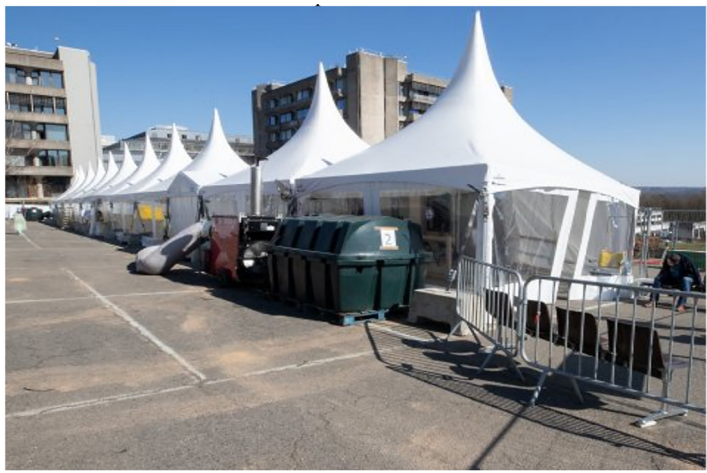
Figure 1. COVID triage centre, University Hospital, Liège (Belgium).

Patient screening and triage is a key opportunity for educating COVID-19 patients to prevent them from transmitting the disease. Effective triage should include patient education at discharge. Despite the constraints (unpredictable workload, in particular), triage and testing settings should be viewed as a good place to improve future patient adherence