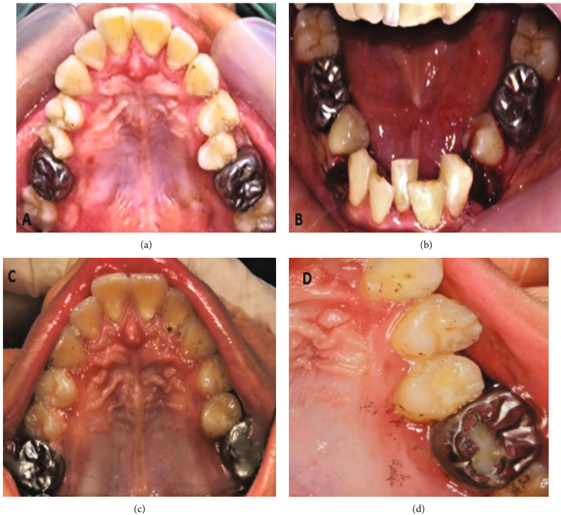
FIGURE 4: (a) Intraoperative upper occlusal views of cemented stainless-steel crown on tooth 16 and tooth 26. (b) Intraoperative lower occlusal view showing mandibular first premolars were extracted and indentation on incisal edge of fusion teeth 31 and 32 was restored with composite resin. (c) Upper occlusal view after 7-month follow-up showing intact stainless-steel crowns (SSCs) on tooth 16 and tooth 26 with evidence of attrited crown on 26. (d) Intraoral pictures focusing on tooth 26 revealed that palatal cusp of tooth 26 is severely attrited and exposing the cement of the crown after 7-month follow-up.

activities (“aversive conditioning”) and pharmacological approach like antidepressant drugs (benzodiazepine or L-dopa) or drugs that have paralytic effect on the muscle through an inhibition of acetylcholine release at the neuromuscular junction (botulinum toxin) which decreases bruxism activity [16].