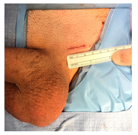
Figure 3 The surgical incision for the microsurgical subinguinal varicocele repair.

atrophy and/or impaired spermatogenesis. Given its small size (1.0–1.5 mm in diameter) and intimate relationship to venous structures targeted for ligation, the risk of injury to the testicular artery is not trivial. Though the actual incidence of injury and subsequent testicular atrophy is unknown, the risk of injury can be made nearly negligible by using magnification (preferably an operating microscope) and Doppler ultrasound, which assist in identification and preservation of the testicular arteries (30,31).