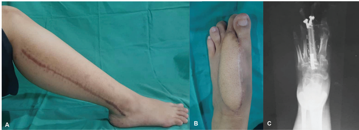
Fig. 3 Right leg (donor site) and left foot (recipient site) appearance after 6 months. The observations as shown by clinical and radiological examinations. (A) The donor site healed well with no obvious skin changes suggestive of ischemic limb. (B) The flap appearance after 6 months. (C) Left foot's X-ray showing minimal hypertrophy with no resorption suggesting graft viability.

comorbidities that may compromise vascularity the fibula flap's donor site. In such cases, we usually opt for the more conventional CTA. Our practice is due to the high cost-to-benefit ratio owing to PAM's rarity in our population. In the last 5 years (from 2016 to 2020), we have performed 51 free fibular transfers for various etiologies and only one of these patients presented with PAM. Unnecessary routine imaging will add a substantial strain to our busy and overburdened radiology unit. Only clinical assessment, perforator identification, and flap planning with handheld Doppler were made in most cases, including this case.