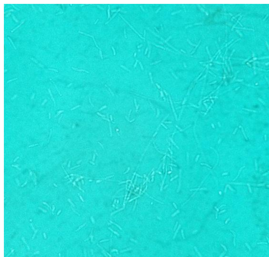
Figure 4: Saprochaete capitata staining with lactophenol cotton blue under microscope (X 400)

After 14 days of treatment with fluconazol 400 mg per day, the patient recovered and all the symptoms disappeared. The phlegm cultured showed negative.