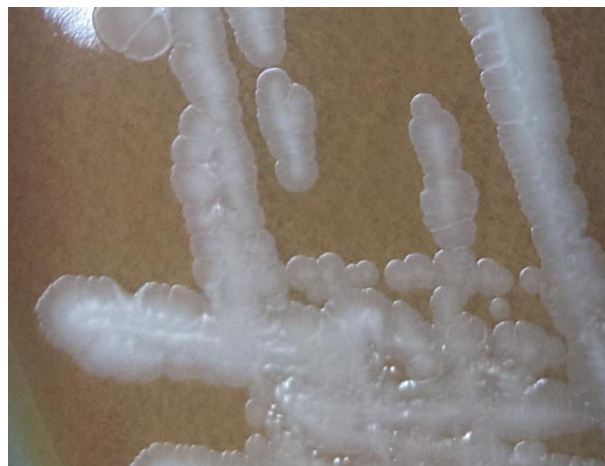
Figure 3: Saprochaete capitata on SAB media at 72 hour at 37°C

After 2 weeks, cough and shortness of breath decreased, fever, however, developed. The patient was then treated with methylprednisolon 40 mg per day for 7 days. After the cease of drug, fever again developed. Therefore, the patient was treated with raxadin 2000 mmg + moxifloxacin 400 mmg + doxycyclin 1000 mmg per day for another 7 days. The patient was still feverish, tired, screeching and snoring was in both sides of the lung. The phlegm of patient was sampled and cultured to find fungi. S. capitata was detected by semi-automatic Vitek system (Figure 3 and 4), the blood cultured showed negative.