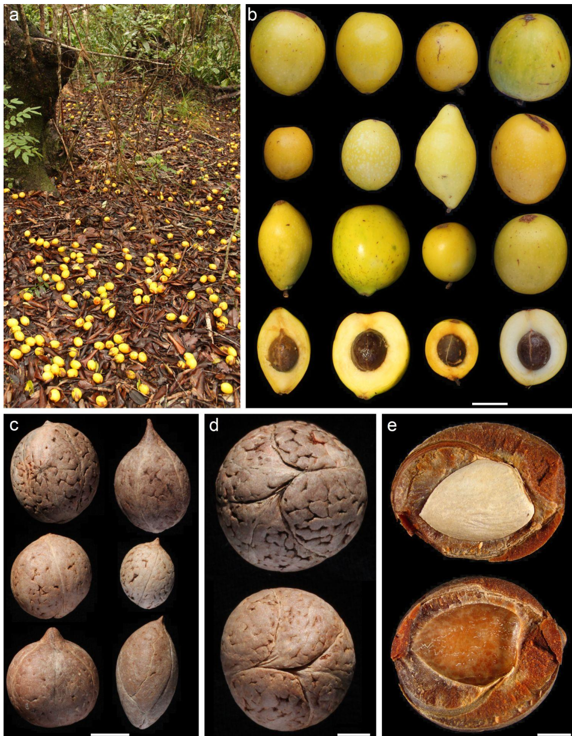
Figure 1. The fruit of Gomortega keule . (a) Fruits ripen and fall during the austral autumn and accumulated in large quantities on the ground due to the lack of consumption by extant native animals; (b) Morphological variation of G. keule fruits (bar scale = 3 cm); (c) Morphological variation of stones (bar scale = 1 cm); (d) Polar view of the stone showing the lines of carpel union (bar scale = 0.5 cm); (e) Open stone showing the hard thick lignified endocarp protecting the soft seed (bar scale = 0.5 cm).

Stones are smooth, spherical to slightly elongated, and sometimes have a pointy end in the distal pole (Figure 1c). Normally, the fleshy pulp is strongly adhered to the endocarp. Stones typically have three lines from pole to pole corresponding to carpel union (Figure 1d); when a strong force is applied, the endocarp cracks and opens along these lines. Seeds are large, flat, soft, oily, and encased