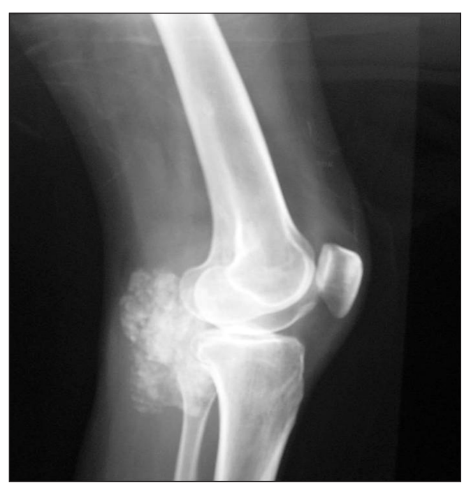
Figure 2: Radiographs of the right knee reveal calcified masses with lucent areas in the popliteal cavity of the knee joint

generally occurs within the second or third decades.<sup>[1]</sup>