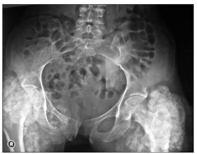
Figure 1: The anteroposterior pelvis graphy, determined multilobular dense nodular components in the periarticular soft tissue around the pelvis joint

28-year-old female patient referred to our clinic with complaints of pain in both hips, a tender palpable mass in the flexor tendons of the right knee and drainage from the fistulized areas on the old incision line in the bilateral trochanteric area. In her medical history, she was first operated in 1993, with diagnosis of tumor calcinosis in the right hip. Later on she had two more operations, with the same diagnosis, on bilateral hips in 1997 and 2007. She had no history of trauma and no other systemic illness was elicited. Laboratory evaluation including serum calcium, phosphorus, and parathormone, and alkaline phosphatase levels were within normal limits. The anteroposterior pelvis graphy, determined multilobular dense nodular components in the periarticular soft tissue around the pelvis joint [Figure 1]. Radiographs of the right knee also revealed calcified masses with lucent areas in the popliteal cavity of the knee joint [Figure 2]. Tc-99m MDP whole body bone scintigraphy revealed an increased uptake with a heterogenic character, in the hip, left iliac wing, and the flexor aspect of