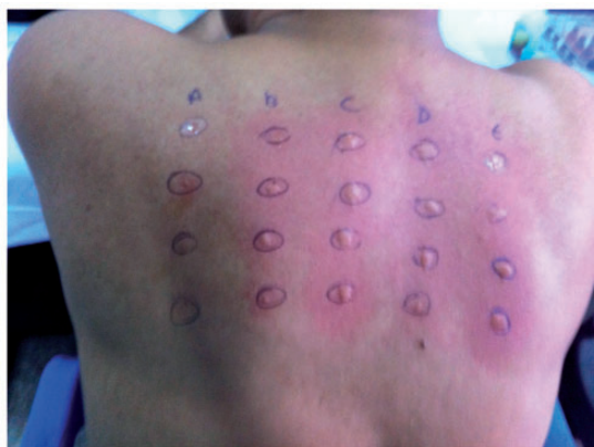
Figure 1. The photograph shows the wheal and erythema due to the prick skin testing.

The prick tests were performed on the skin surface over the upper back of the patient. After cleaning the test site with alcohol swab, the skin prick tests were performed by 1 of the 2 investigators. Circles were drawn with a ball point pen, 2 cm apart to ensure uniform spacing between the applications. The allergen extract was applied within the circle using the dropper on to the skin as per standard protocols. 6,7 The time of the first prick was noted. Individual lancets (Manufacturer—MEDIPOINT Lancet, Mineola, NY) were used for each prick. A single technique skin prick of piercing the skin at 45° to 60° angle to the surface using the lancet was used as described in the accepted international protocol. 5 Allergen response was measured at roughly 18 minutes from the initial prick. After careful blotting of the excess allergens, the wheal diameter (Figure 1) was measured in both the longitudinal and the transverse axis in millimeters, and the readings were recorded in the clinical reporting form. The positive reaction was considered as 3 mm above the negative control measured for the subject according to international protocol. 5 After the test, the subjects were duly instructed and discharged in a satisfactory condition. The mean wheal surface area was calculated for each of the measurements. The 2 investigators who performed the test did a pilot testing on 10 subjects to ensure that their technique was similar and the wheal size comparable.