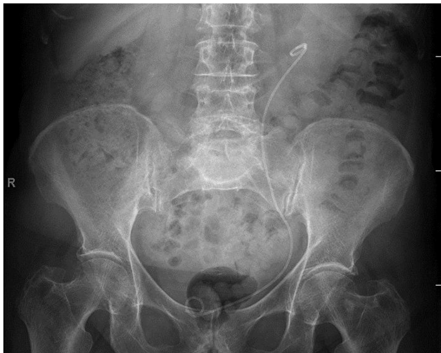
Fig. 2. The pigtail placed into the left kidney.