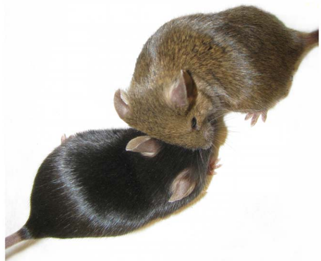
Figure 3. Mice produced by ICSI. Mice produced from sperm dried with 100 mmol/L 3-OMG for 6 minutes and stored in LiCl jars at 4°C for one year. doi:10.1371/journal.pone.0029924.g003