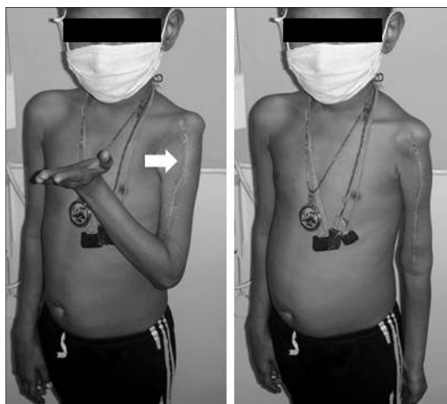
Figure 4: Postoperative elbow and hand function. Arrow highlights the long surgical scar

When evaluating a reconstruction technique we need to consider the ease of the procedure, its complications, functional outcome, and the durability of the reconstruct. Although a longer follow-up would be ideal, this technique provides an