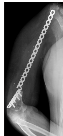
Figure 3: Plate breakage (case: 1) at 13 months when a conventional reconstruction plate was used