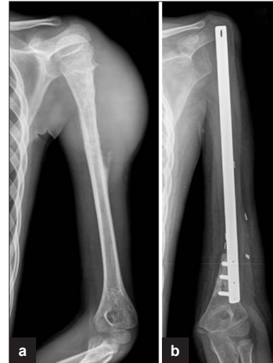
Figure 2: (a) Radiograph showing Ewing's sarcoma of the proximal humerus (b) Radiograph showing reconstruction with the customised plate