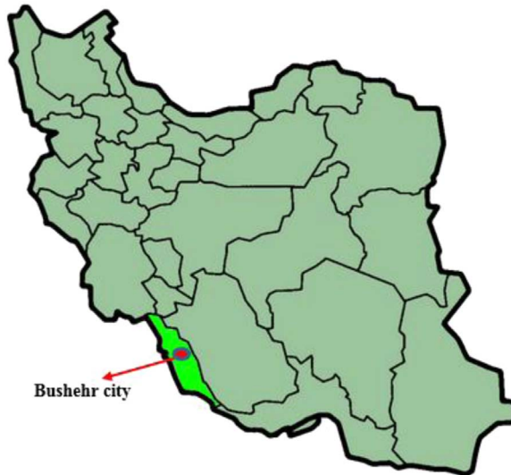
Fig. 2. Bushehr city location in Iran map.