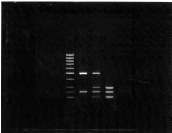
Fig. 2. RFLP results of TaqI enzyme. Lane 1, Gene Ruler™ 50 bp DNA Ladder. Lane 2, TT genotype (493 bp and 247 bp, homozygous). Lane 3, Tt genotype (493 bp, 291 bp, 247 bp and 202 bp, heterozygous). Lane 4, tt genotype (291 bp, 247 bp and 202 bp, homozygous).

band, designated as A (Fig. 1). The presence of TaqI restriction site causes splitting of the PCR product into three bands, 291 bp, 247 bp and 202 bp respectively, designated as t . If RFLP-associated TaqI restriction site is not found in the corresponding sequence were split into two bands, 493 bp and 247 bp respectively, designated as T (Fig. 2).