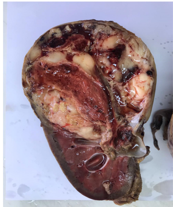
Fig. 2. Macroscopic examination revealed a lobulated, grayish white, firm mass in the upper pole, reaching up to the capsule with focal areas of necrosis.

to rule out metastases, a thoraco-abdomino-pelvic CT was performed. It confirmed the presence of an upper right polar renal mass, with a cystic and solid component, measuring 10 × 9 × 7 cm (Fig. 1) significantly enhanced after injection of contrast agent, invading the pelvis, in contact with the inferior side of the liver but was separated from the right adrenal gland. The right renal vein and the contralateral kidney were unharmed. There were no radiological signs suggesting a locoregional or distant metastases.