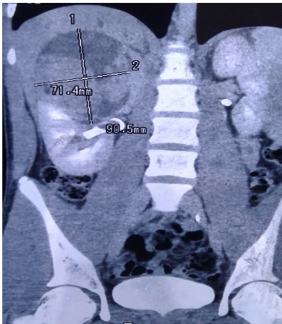
Fig. 1. Computed tomography of abdomen and pelvis (coronal view) showing an enhancing, heterogeneous, 9 × 7 cm mass-situated in the upper polar of the right kidney.