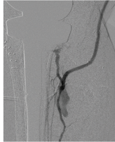
FIGURE 4: Arteriography of right knee (after bypass grafting) showing the recovery of lower limb circulation.

According to a previous report, acute arterial occlusions after TKA are relatively rare. Rand reported 3 cases of acute arterial occlusions among 9,022 patients undergoing TKA