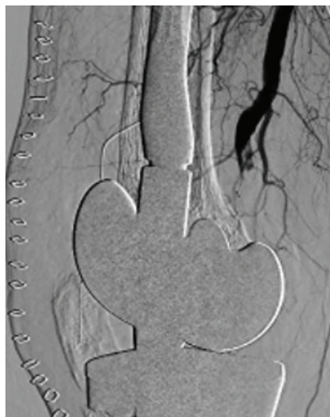
FIGURE 3: Arteriography of right knee showing the popliteal artery occlusion.

catheter was unsuccessful, so femoral artery to posterior tibial artery bypass with large saphenous vein graft and relaxing incision was immediately performed. The resumption of the lower limb circulation was confirmed by arteriogram 12 hours after the second revision TKA (Figure 4).