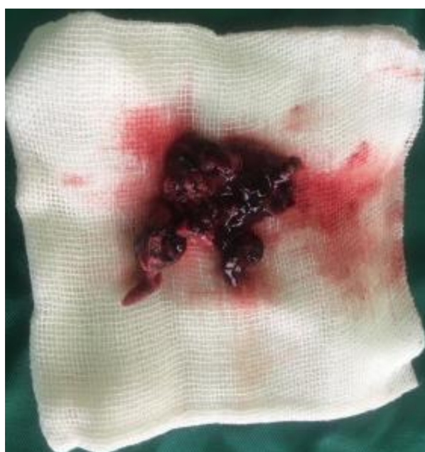
Figure 2: Pulmonary artery clot (left) and right ventricle clot (right) of case 2 extracted via thrombectomy.