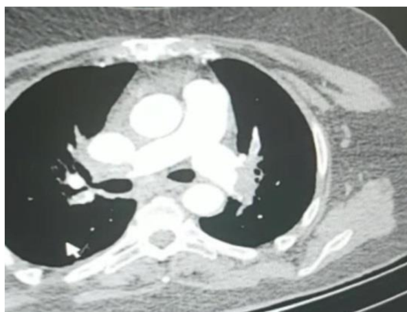
Figure 1: Pulmonary computed tomography angiography of case 1.