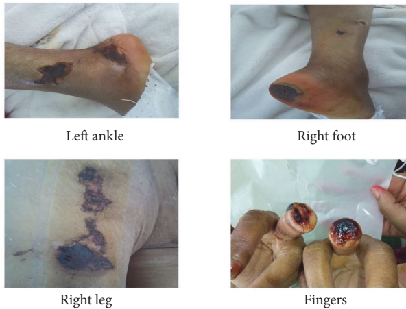
FIGURE 1: Topography and aspect of Calciphylaxis lesions of patient 1.

and symmetrical peripheral pulses. Its biological assessment revealed phosphocalcic balance disorders with an elevated parathormone (PTH) and alkaline phosphatase (PAL) at 919 pg / ml and 348 UI / l, respectively, a calcium level at 2.2 mmol / l under calcium carbonate, a normal serum phosphorus at 1.03 mmol / l, a vitamin D deficiency at 14.2 ng / ml, and normocytic normochromic anemia. Dosage of prothrombotic factors (C and S proteins, antiphospholipid antibodies, anticardiolipin antibody, anti-b2 glycoprotein 1 antibody, circulating anticoagulant, and cryoglobulinemia) was normal. Cervical ultrasound has found bilateral parathyroid nodules. X-rays of the skeleton showed bone demineralization with extensive calcification of the vessels. The patient initially received symptomatic treatment with an opioid analgesic (Tramadol sometimes associated with Nefopam), blood transfusion, and erythropoietin to correct anemia.