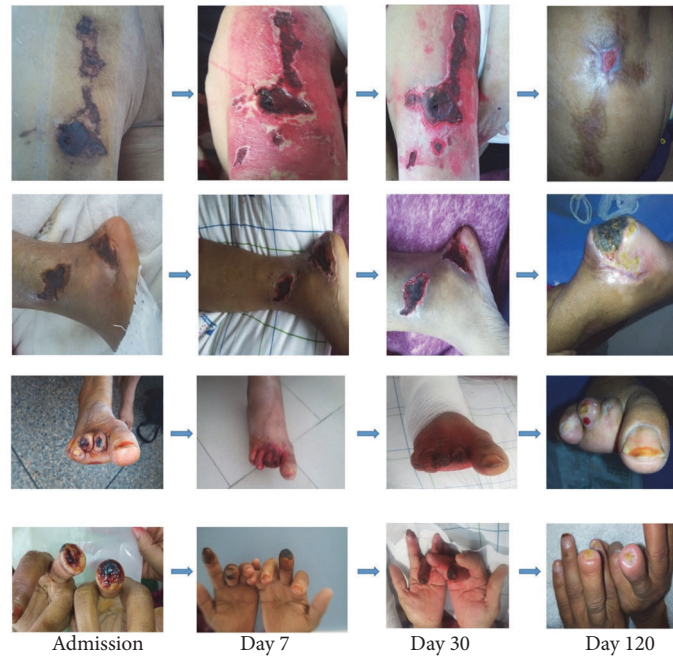
FIGURE 2: Evolution of Calciphylaxis lesions over 4 months of treatment in patient 1. Necrosectomy could not be performed at the heels because of the risk of injury to the Achilles tendon.