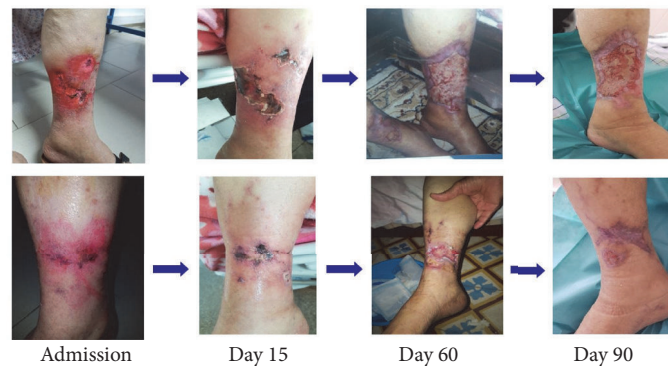
FIGURE 5: Evolution of Calciphylaxis lesions over 3 months of treatment in patient 2.

The evolution is done in a few days towards the formation of superficial and then deep ulcerations leading to the constitution of a blackish eschar, always strongly painful with centrifugal extension [11].