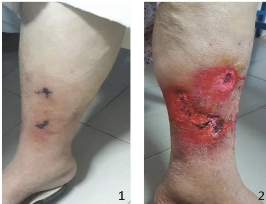
FIGURE 3: Calciphylaxis lesions at the admission of patient 2 (A: right leg, B: left leg).

The development of calciphylaxis goes through two phases: a silent phase where vascular calcifications are formed in the media with intimal hyperplasia of dermal and hypodermic arterioles, and then a phase of microcirculatory decompensation, which corresponds to thrombosis ischemia most often [8].