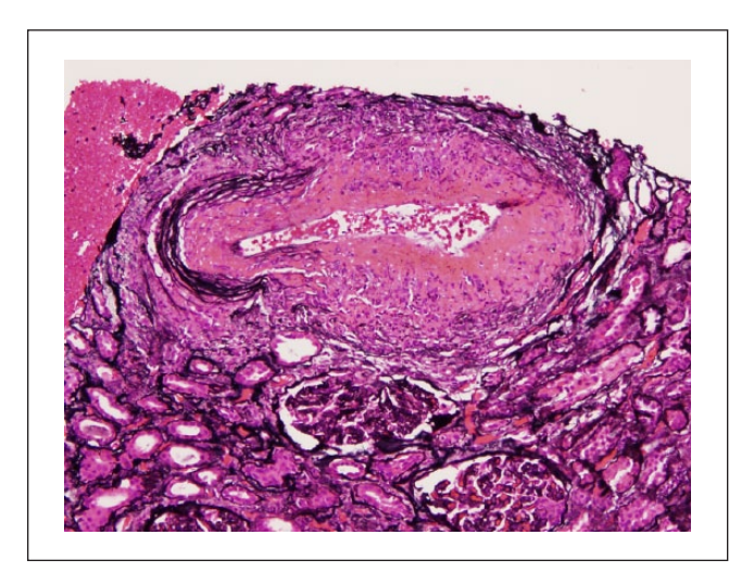
Figure 2. Artery with necrotizing vasculitis, with prominent transmural necrosis and inflammatory infiltrate (Jones methenamine silver stain, original magnification 20×).

due to mononuclear cell infiltrate and destruction of the vessel wall.<sup>9</sup> The 2 conditions can only reliably be distinguished by biopsy.<sup>9</sup>