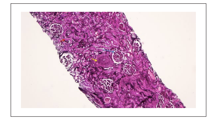
Figure 1. Renal cortex containing glomeruli with ischemic-type wrinkling of capillary walls (blue arrow). There is a background of diffuse interstitial fibrosis and tubular atrophy (red arrow). Arteries show prominent thickening due to concentric smooth muscle hyperplasia (yellow arrow;. Jones methenamine silver stain, original magnification 10×).