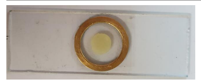
Fig. 1: A sample of a packed composite resin

Another slide was compressed over the paste to pack the composite sample into the ring (Fig. 1). The surfaces of the sample and the metal ring were then covered with a coverslip (0.13 mm in thickness), and the assembly was placed on the jig of the LVDT.