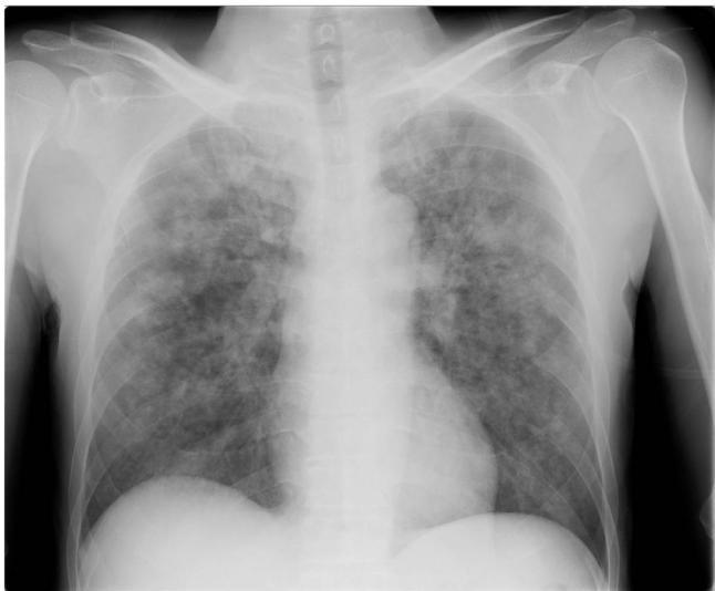
Fig. 1. A chest X-ray obtained on admission showed diffuse infiltration throughout all lung fields.

irritation and laryngeal edema were not observed. Serum laboratory tests showed that the white blood cell count was elevated to 17,600/ \mu L (neutrophils: 91.4%, lymphocytes: 5.6%, eosinophils: 0.1%, and monocytes: 2.7%), and also showed the elevation of serum lactate dehydrogenase (LDH) (391 IU/L), total bilirubin (1.6 mg/dL), C-reactive protein (1.49 mg/dL), and surfactant protein D (150 ng/