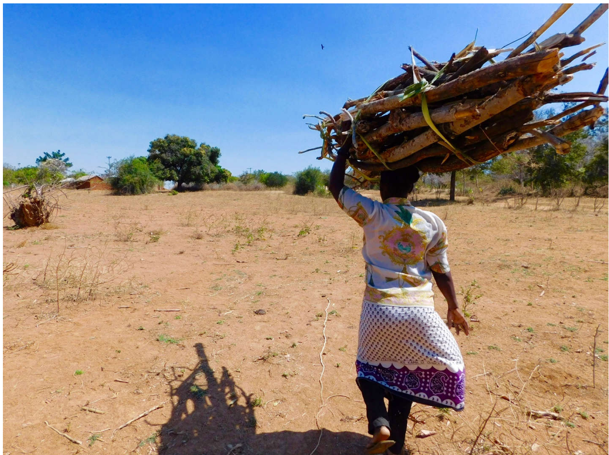
Figure 1. A female carrying a load of wood in Shinyanga region, Tanzania, July–August 2016.

Load-carrying exposures for our participants in Tanzania have been previously reported [21]. Briefly, on the interview date, women were carrying loads of water (n = 51; 62%), wood (n = 17; 21%) or agricultural products (n = 14; 17%). The average weight of all loads measured in Tanzania was 20.0 kg (SE: 0.6): water weighed an average of 20.4 kg (SE: 0.6), wood 21.0 kg (SE: 2.3), and agricultural products 15.9 kg (SE: 1.2). Women reported carrying an average of 3 loads per day in the last 7 days (SE: 0.2), corroborated by information collected using GPS devices from a sub-sample of study participants (n = 14). GPS data revealed an average of 3.6 load-carrying trips per day (range: 1–9 trips), covering an average total distance of 5.32 miles over the course of the 24-h wearing period [21]. Those categorized in the “high” load-carrying exposure index group carried a slightly heavier average load weight, but at a greater frequency compared to those in the “low” index group (weight: 20.0 kg (SE: 0.9) versus 19.2 kg (SE: 0.9); frequency: 33.5 loads/week (SE: 2.3) versus 11 loads/week (SE: 0.9), respectively).