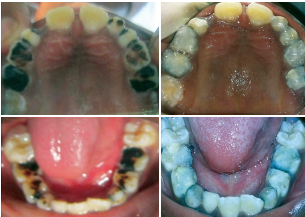
Fig. 5: Pretreatment and posttreatment