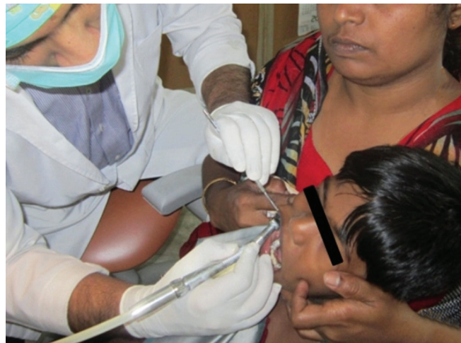
Fig. 4: Orientation appointment