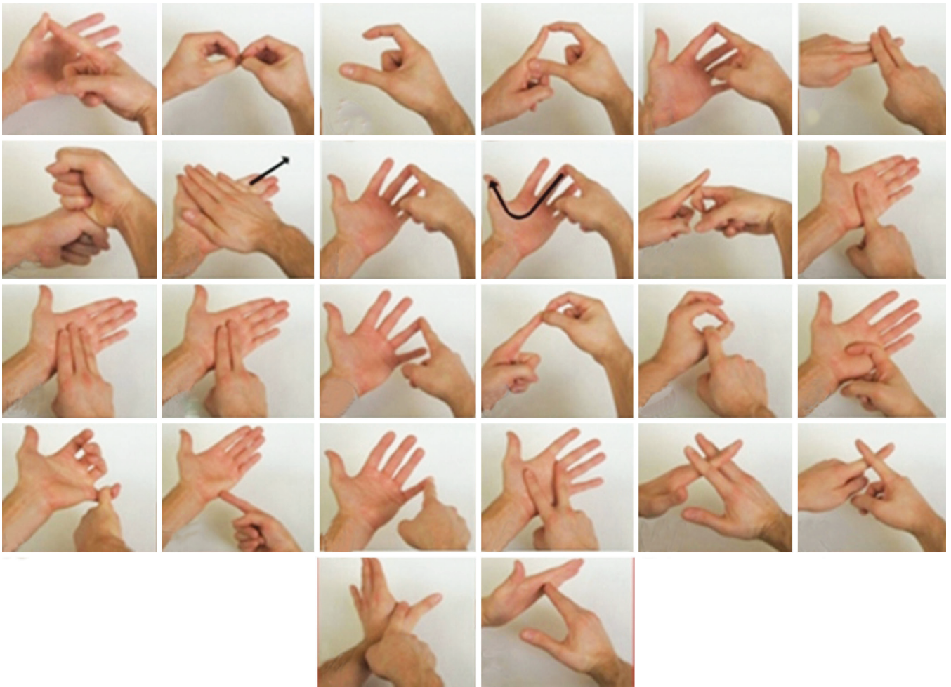
Fig. 1: Sign language