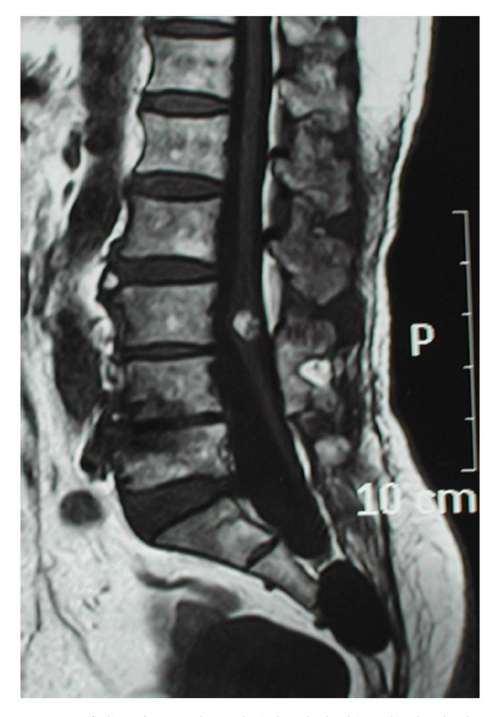
Figure 1. MRI findings of a cyst in the sacral spinal canal, a low-lying tethered cord and a intramedullary tumor at L3 level. doi:10.1371/journal.pone.0039958.g001

two cases. Tethered spinal cord and intramedullary teratoma at L3 vertebral level were revealed in one case (Fig. 1) and tethered spinal cord with syringomyelia in the other (Fig. 2).