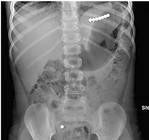
Fig. 1 Basal abdominal X-Ray showing 7 magnets in the epigastric area and one in the right iliac fossa

polyethylene glycol administration. On day 3, the patient was asymptomatic, with no sign of perforation. Another abdominal X-ray and small bowel ultrasound (US) were performed. Although the X-ray showed the little magnets chain in a substantially unchanged position and all regularly spaced (Fig. 2A), the small bowel US clearly showed that there were a gap in the magnet chain as one of them was located in a different intestinal loop and that adjacent intestinal small bowel walls were trapped between two magnets (Fig. 2B). A surgical minilaparotomic approach was planned. The inspection of the whole small bowel revealed two small bowel loops hardly adherent with an initially covered perforation, as shown in Fig. 3. Enterostomy allowed the retrieval of 7 magnets in a loop and the other one in the contiguous loop and perforation's repair. The patient recovered well and was discharged on day 4.