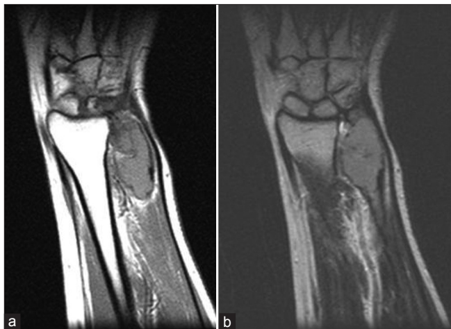
Figure 2: Magnetic resonance imaging showing T1W hypointense and T2W heterogeneous signal in the lesion