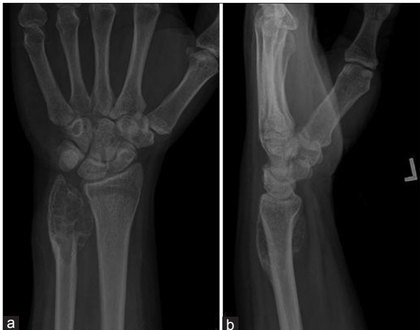
Figure 1: Radiograph anteroposterior (a) and lateral view (b) of forearm and wrist showing expansile, lobulated osteolytic lesion in the distal end of the ulna

examination of the surgical margin was tumor free. In the postoperative period, the wrist joint was splinted in an above-elbow plaster of Paris (POP) slab for two weeks, and then gradual movements of the wrist joint was initiated; complete bony fusion of the graft to the distal end of the radius was confirmed on radiographs after two-and-a-half months of surgery.