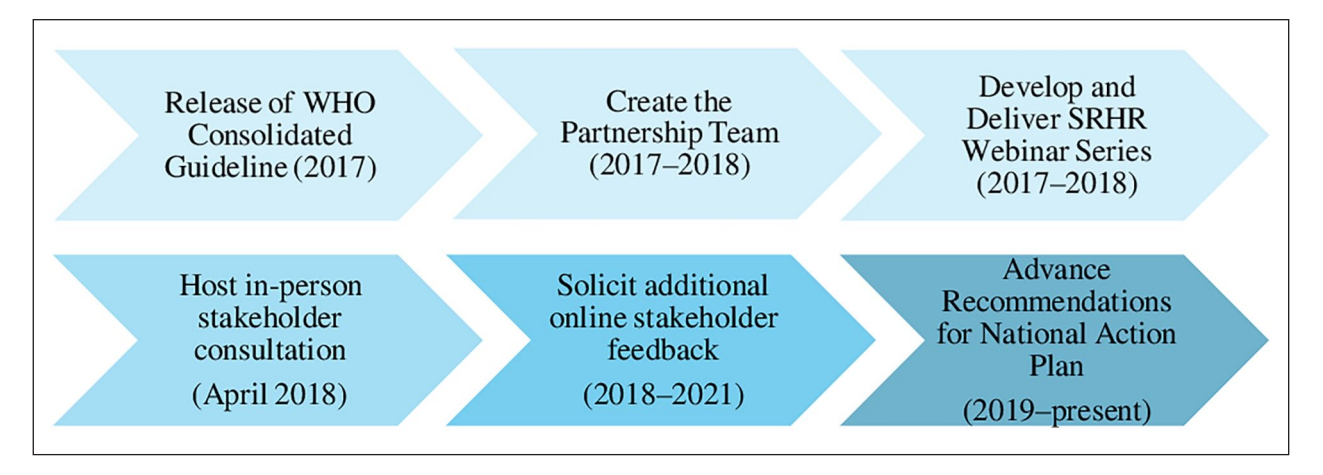
Figure 1. Phases for developing recommendations to inform a National Action Plan to advance Sexual and Reproductive Health and Rights of Women Living with HIV in Canada.

women living with HIV, including newcomer and refugee populations. CAAN serves Indigenous communities affected by HIV across Canada, highlighting ongoing impacts of colonization and the residential school system on health and social policies that constrain sexual and reproductive rights and well-being of Indigenous women living with HIV. CPPN is a community-based organization by, with, and for people living with HIV, which emphasizes the role of stigma, discrimination, and other social determinants of health on shaping lived experiences of women living with HIV.