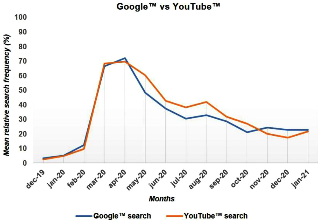
Fig 2. Chart-line plot depicting relative frequency of worldwide search for “donning and doffing” on both Google and YouTube searches, observed between the December 1, 2019 and the January 31, 2021.