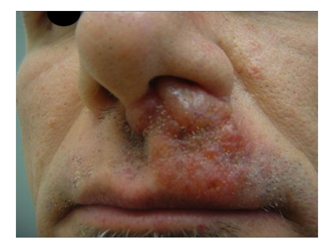
Fig. 1. Primary cutaneous amyloidoma: perinasal mass on the left upper lip with a multinodular surface without ulceration.