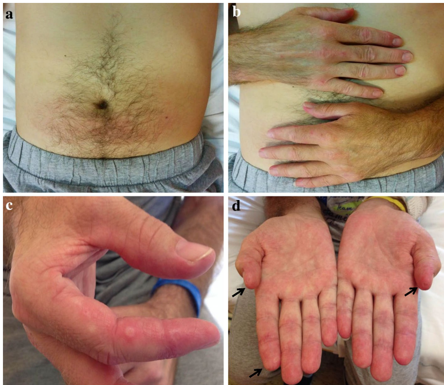
Fig. 2 Violaceous erythema of the abdomen (a), Gottron's sign (b), tender palm papules (c) with signs of necrosis (d arrows) of patient #1 at admission

The diagnosis of scarcely myopathic but highly aggressive dermatomyositis was thus formulated. High dose steroids (iv pulse therapy with 1 gr 6MP for 5 days with slow oral taper-out) followed by IVIG (2 g/kg/d over 3 days with a second reload after 21 days), oral Cyclosporin A (4 mg/kg/d) together with hydroxychloroquine (5.4 mg/kg/d) were used as therapy with stunning results. Heliotrope