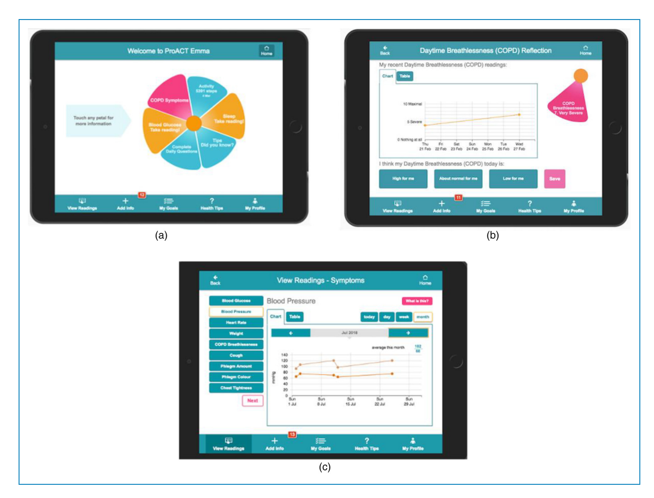
Figure 1. Participant CareApp showing (a) dashboard highlighting current status, (b) reflecting on data and (c) viewing readings.

This work took place within a larger action research proof-of-concept trial to explore the use of technology to support self-management and enhanced integrated care for