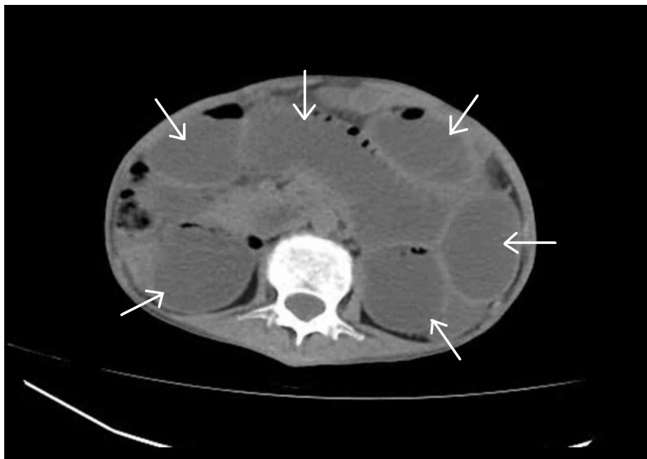
FIGURE 2: Preoperative axial computed tomography (CT) scan of the abdomen showing dilated small bowel loops (arrows).

Intraoperative inspection showed stricture at the proximal jejunum. Adhesions in the whole abdomen and 200 ml of frank pus surrounding the stricture were observed. The small bowel was distended proximal to the stricture and collapsed distal to it (Figure 3). Intraoperative inspection of the abdominal cavity showed no evidence of metastatic lesions in the liver or peritoneum. En-bloc resection of the stricture with primary anastomosis was performed. Postoperative recovery was uneventful, and the patient was discharged after two days.