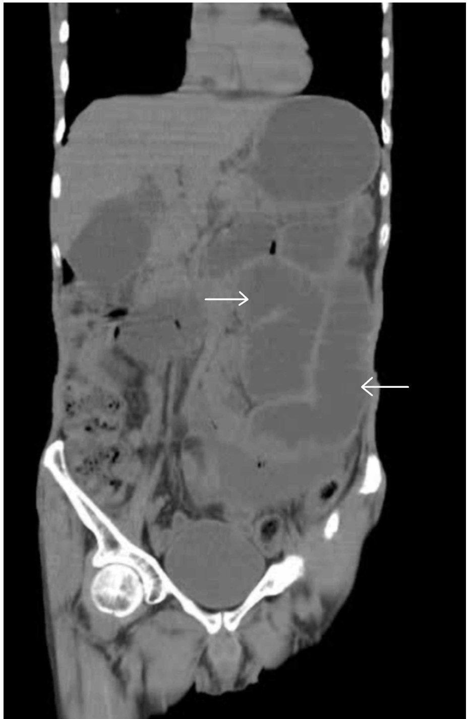
FIGURE 1: Preoperative coronal computed tomography (CT) scan of the abdomen showing dilated small bowel loops (arrows).