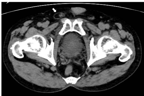
Figure 1. Abdominal computed tomography imaging. A groin hernia in the right inguinal region (arrow).