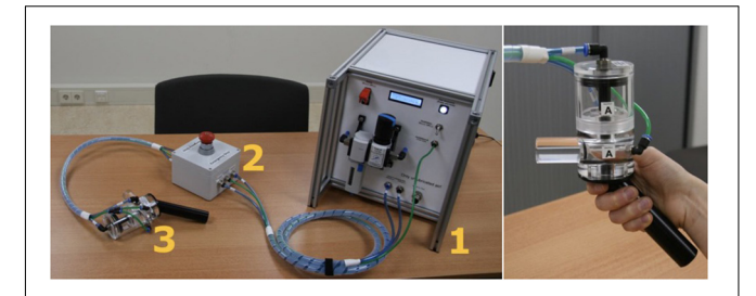
FIGURE 1 Components of PEPPA. 1 shows the main device, 2 the emergency stop button, and 3 shows the handpiece. The picture on the right shows how the thumb can be placed into the handpiece.

A sham Transcutaneous Electrical Nerve Stimulation (TENS) device (Bentrotens T37, Bentronic Gesellschaft fuer Medizintechnik GmbH, Wolnzach, Germany) will serve as nocebo conditioning stimulus (CS) in the first part of the treatment (the conditioning session), during which it is