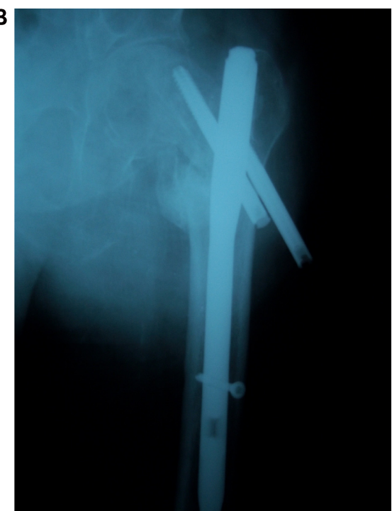
Figure I (A and B) Images of lateral migration of PFN head screws and cutout. Abbreviation: PFN, proximal femoral nail.

The SWS score was not significantly associated with the fracture type, age, sex, and time from fracture to surgery (P=0.051, P=0.628, P=0.608, and P=0.462, respectively). A postoperative SWS score of very good correlated with an excellent reduction in the early postoperative stage. We found a significant association between SWS score and reduction quality ( \chi^2 =35.446, P=0.000).