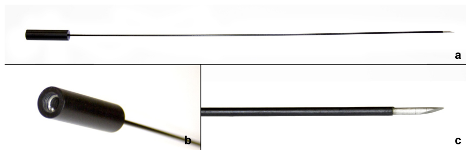
Figure 1 Needle developed for transvaginal ovarian cauterization: (a) the needle; (b) the connexion for eletrocautery; (c) the distal tip not insulated.

Forty eight hours after cauterization, animals were sacrificed and injuries due to puncture or cauterization in the needle path were searched. Although the total thermal dose (n puncture \times n second \times Power W) delivered was 800 J (4 \times 5 s \times 40 W) on the right side and 1600 J (4 \times 10 s \times 40 W) on the left [5], no lesion could be found in the needle path.