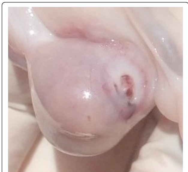
Figure 2 Lesion in cauterized ovary of a Corriedale sheep (macroscopy).

The main difficulty of the experiments was the correctly identification of the sheep ovaries. Ovarian size and antral follicles count are much smaller in the sheep than in cattle or humans. This may help explain the high variation in the gray-scale pixel values observed in the ultrasound image [15].