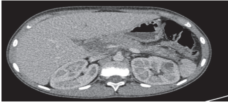
FIGURE 1: Abdominal CT showing a stage E pancreatitis.