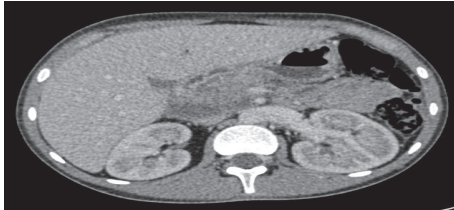
FIGURE 2: Abdominal CT showing a stage E pancreatitis.