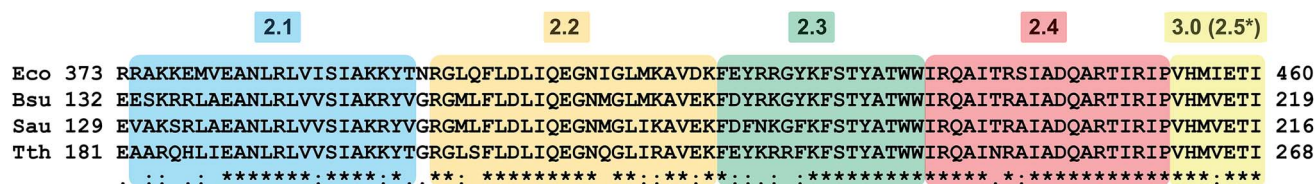
Fig. 2 Sequence alignment of region 2 of SigA. The protein sequences were obtained from NCBI and aligned using Clustal Omega ( https://www.ebi.ac.uk/Tools/msa/clustalo/ ). The regions were assigned according to Vassilyev et al. 18 *Region 2.5 was later named region 3.0 15 . The accession number of proteins used for the analysis are: Eco ( E. coli ): AAC76103.1; Bsu ( B. subtilis ): CAB14450.2; Sau ( S. aureus ): BAF67736.1; Tth ( Thermus thermophilus ): BAD70355.1. The D201 position is indicated by an arrow.

All the chemicals and reagents used in this study were of analytical grade. GPI0363 was obtained from the chemical library of the Drug Discovery Initiative at the University of Tokyo and its purity was confirmed by ultra-performance liquid chromatography-high