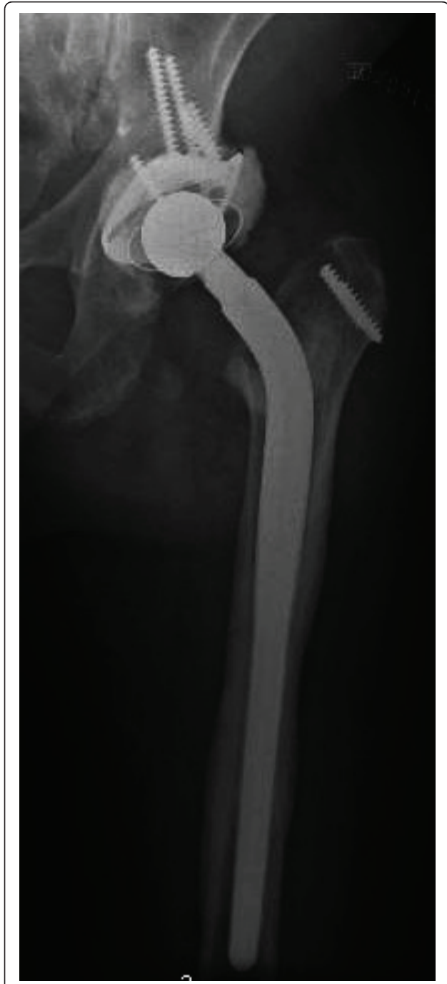
Figure 4 Hip reconstruction with a metallic reinforcement ring and a conical cementless stem, without acetabular bone loss. Cancellous bone allograft was used in the femoral side.

No complications were reported in the perioperative course and during the hospitalization period.