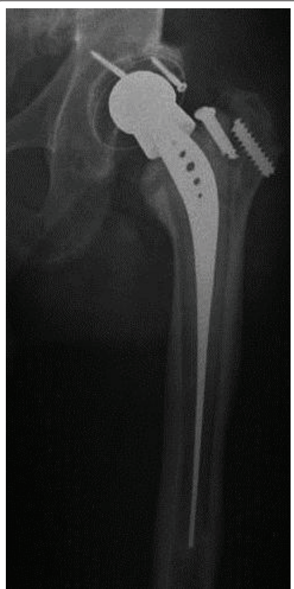
Figure 1 Twenty years after primary hip arthroplasty. The radiograph shows loosening of the isoelastic cementless femoral stem and well-fixed titanium-coated RM acetabular cup.

In this case, we used chisels to weak the superior part of the implant and to create a roughness surface for the reamer action. When the polyethylene was thin enough, it was removed easily by hand tools without the risks of