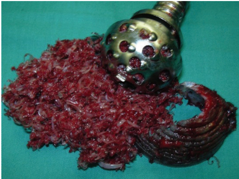
Figure 3 When the polyethylene layer was thin enough, the remaining cup was removed easily by hand tools and bone stock is preserved.