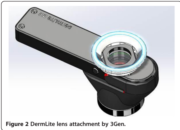
Figure 2 DermLite lens attachment by 3Gen.

photograph to the repository, they are asked a series of questions including: (1) date the photo was taken, (2) if they had previously submitted a photo of that particular mole, mark or spot, (3) location of the mole, mark, or spot (with a drop down menu of options to select from), and, (4) symptoms of the mole, mark or spot (with a drop down menu of options to select from). The photos will be reviewed by study staff to ensure acceptable quality and content before they are sent to the study dermatologist. The photographs will be reviewed by the study dermatologist and an individualized report and status will be generated for each photograph (for example, (a) morphology is suggestive of a benign lesion; (b) morphology is indeterminate and management will require evaluation and follow-up with a physician; (c) lesion has morphologic features suggestive of malignancy; and, (d) image is of insufficient quality - photograph needs to be retaken). The report will be sent to the corresponding participant's physician. The participant will be instructed to contact his or her identified physician to receive the teledermoscopy report and to discuss follow-up measures.