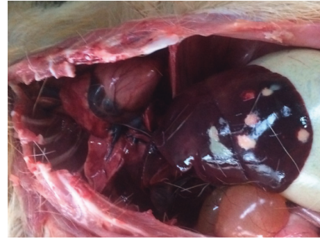
FIGURE 1: Liver of the agouti showing white and red circumscribed lesions.

2.4. Bacteriological Examination. Samples of the lesions were taken from the lungs and liver for bacteriological examination. Swabs taken from the lesions were inoculated onto Columbia agar supplemented with 5% sheep blood and