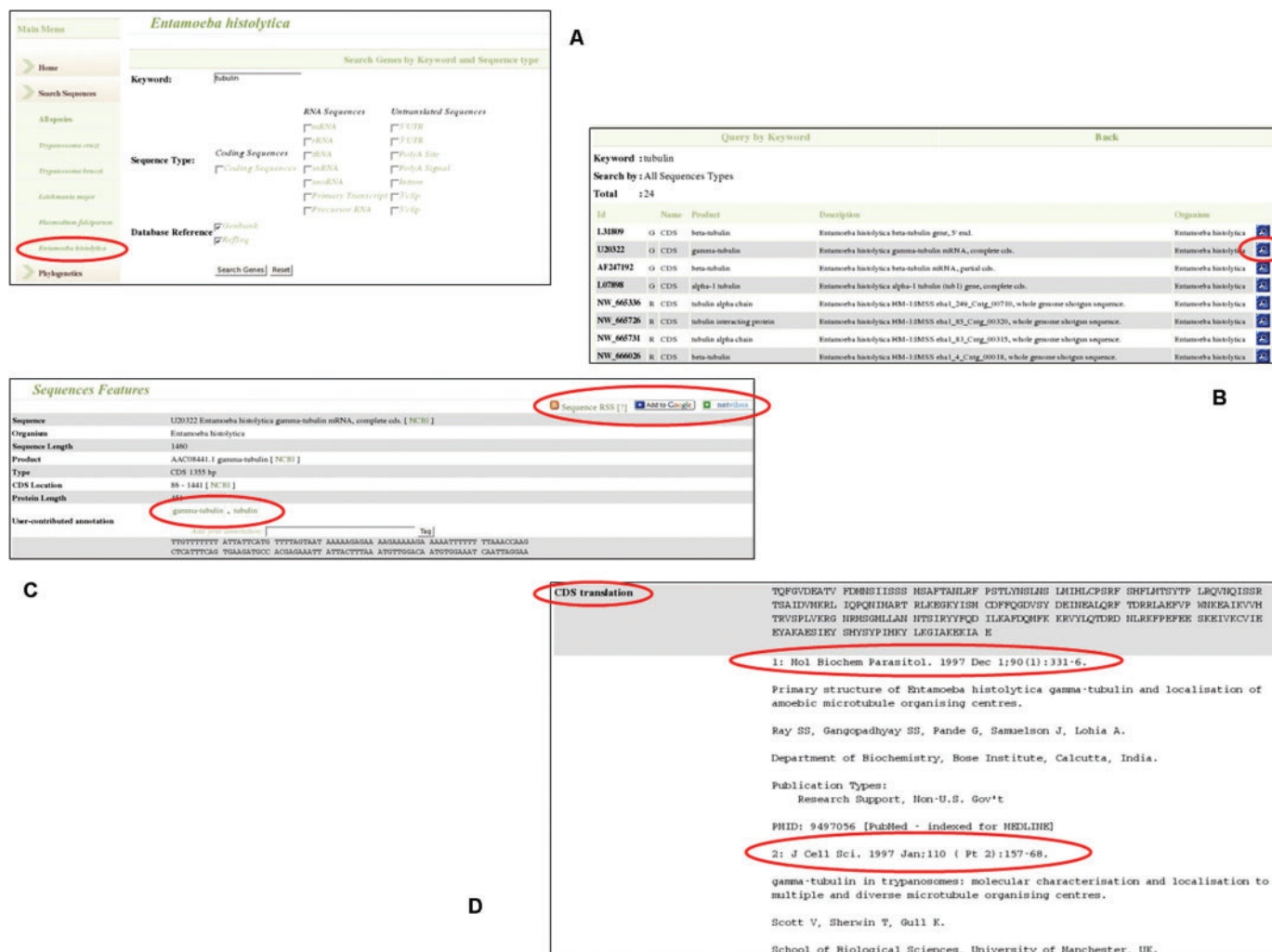
Figure 1. Features of the Search Sequences tool in ProtozoaDB. (A) searching E. histolytica subset, (B) choosing U20322 entry, (C) details of U20322 entry that can be tracked with RSS, Google or Netvibes and (D) CDS of U20322 entry and associated abstracts published in PubMed.